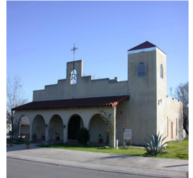
Santa Francisca Cabrini Church 1606 San Casimiro