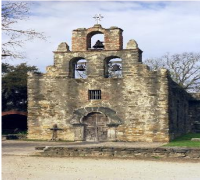
Misión San Francisco 10040 Espada Rd